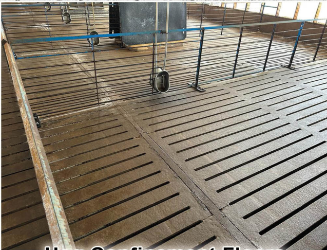
Hog Confinement Floors Finished with our FLAT Sealer