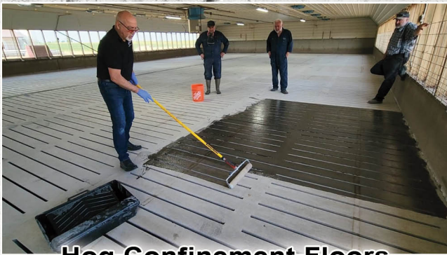
Hog Confinement Floors