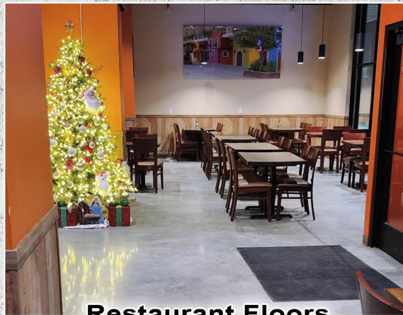
Restaurant Floors Finished with our GLOSS Sealer